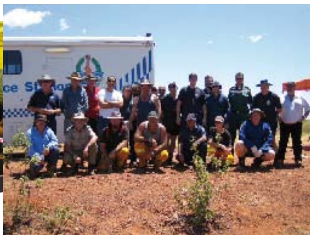
Some of the people involved