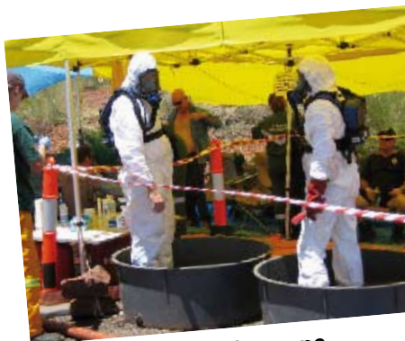
Coming out of the scene

Emergency personnel were required to rest and drink fluid after being observed as unfit to enter the scene on 28 separate occasions. This often delayed the operational crews from entering the scene and in some cases for an extended period of time.