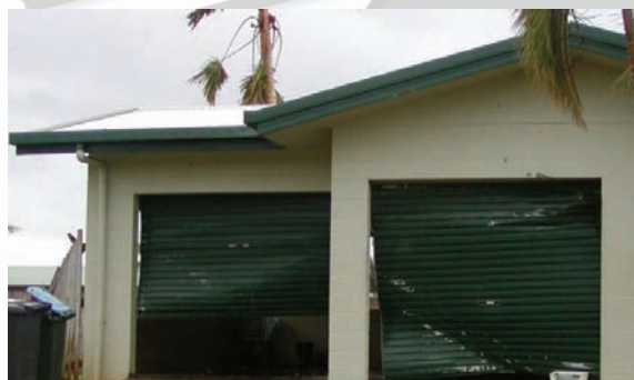
Damage to garage doors.

It is common to see garage doors fail when they are pushed in or out by strong winds.