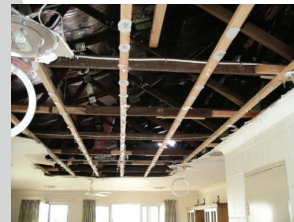
Damage to ceiling due to water ingress

Damage to eaves lining by strong winds is another common cause of damage to houses. This can happen due to inadequate fixing or support for the eaves lining or because the lining spans too far. Eaves lining damage allows rain and wind to blow into the roof space, which may result in damage to ceiling and wall lining inside your house.