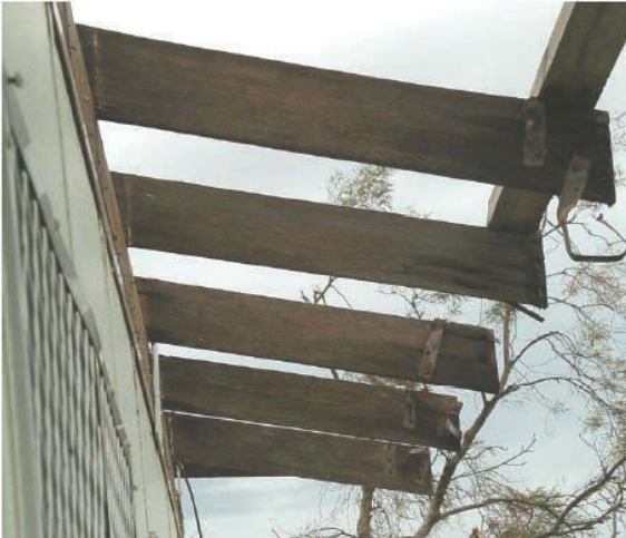
Corroded batten straps contributing to roof failure

You should check for signs of corrosion around the house. This is the time to look inside the roof space for corrosion of metal roof coverings, metal battens, batten straps, fixing bolts, fixing plates, screws, nails, etc. Note that the risk of corrosion is particularly relevant in areas near the coast. Metal components showing signs of corrosion may need replacing.