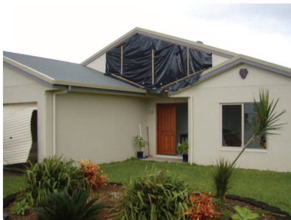
Failure of a gable end wall allowing strong wind and rain water into the house

The gable end walls of a house can take a tremendous pounding during a cyclone. If not properly braced and anchored, they can collapse and cause significant damage to the house. In general, the taller the gable end triangle, the greater the risk of damage. However, gable end walls are usually easy to strengthen through bracing, if necessary.