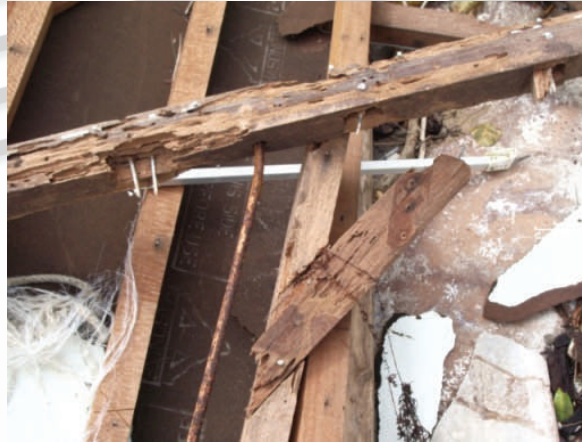
Termite attack to timber

Cyclonic regions within Australia are often areas of high termite risk and therefore, timbers in your house may be susceptible to termite attack. Timber protection systems require on-going inspection and maintenance to ensure they provide an effective on-going barrier to termite attack. If it is found that termites have attacked timbers in your house, expert advice should be sought on whether the timber needs to be replaced and to repair the termite barrier.