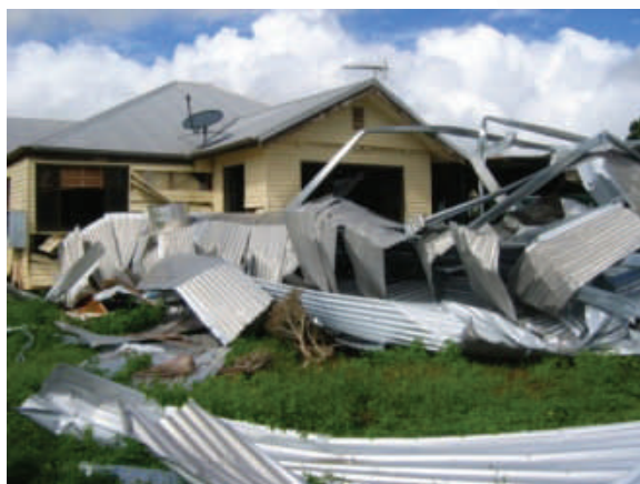
Flying debris resting in front of a house

Other outdoor objects and equipment such as air conditioning equipment, hot water tanks, swimming pool equipment, solar water panels, satellite dishes, antennas and similar objects may be blown around in a cyclone and can become flying debris that could impact your house or other houses in your neighborhood. You should ensure that all equipment is not loose and that it is properly fixed.